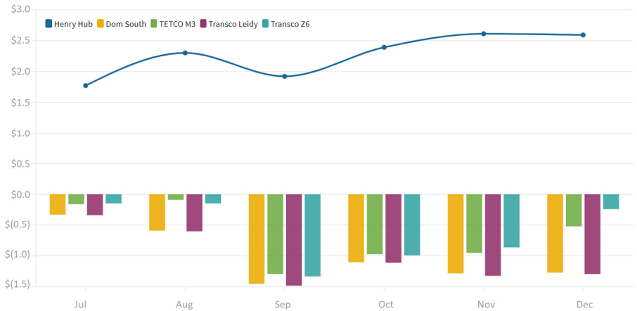
Natural Gas Prices (2) and Basis Pricing (3) Increase in Henry Hub price from mid-year low - Significant decreases in basis took away most of HH increases